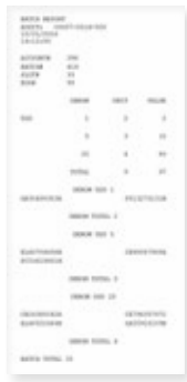
Optionally, print a detailed report of denomination totals and serial numbers.

Doc Find: Pull buy money out of seize money significantly faster and get buy money back into the agency budget right away.