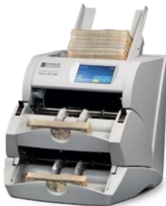
JetScan iFX i200 series with two fully functional pockets for non-stop processing also available.

Power: 105-253 VAC, automatic switching, 50/60 Hz.